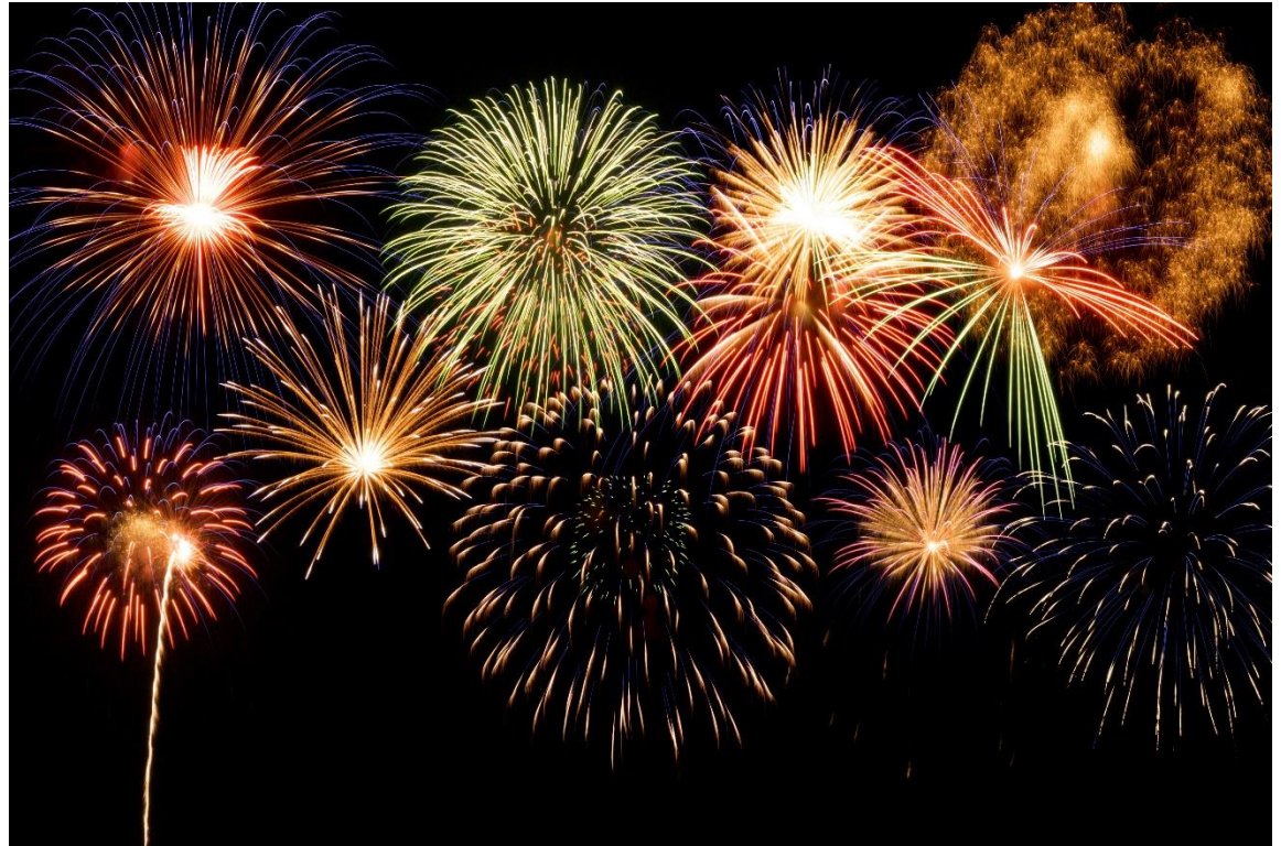
Happy New Year from PCEA! Even in astronomy, there is a sense of new beginnings. The days are starting to get longer again as we look forward to the light's re-emergence. January is also the best time to start planning your garden for the upcoming season.

We wish all our members and readers a joyous and happy new year, and we look forward to seeing you at our membership meeting on January 12. Meetings are held every 2 nd Thursday at Fat Man's Café, 1450 Greene Street in Augusta.