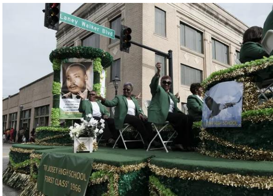
Join Augusta and the Augusta branch of the NAACP in celebrating the life and legacy of civil rights icon Dr. Martin Luther King, Jr., during the annual Martin Luther King Jr. Parade set for Saturday, January 14, 2023. The parade begins at 1:00 pm and will start at Dyess Park Community Center, located at 902 James Brown Blvd. The parade will proceed south on James Brown Blvd., then west onto Wrightsboro Road, north onto Augusta Ave., east onto Laney Walker Blvd., and then north onto 11th Street to Johnson Motors..

will set aside, and keep a regular log of whether you achieved that goal. Seeing results, whether successful or not, will help keep you motivated. Goal-setting should also be Achievable . Make the goal hard to reach, but not impossible. Break the larger goal into smaller, digestible pieces that you can track. If your goal is to be more active, set a goal of spending 30 minutes outdoors every workday. Plan activities that interest you so you'll be more likely to do them. Relevance is also a key determination of whether you stick with a goal. When creating a goal, ask yourself, "What will be the most beneficial?" and "Is there a more relevant goal?". Lastly, good goals have a Timeline . Without a deadline, goals tend to evaporate into the expanse. Set a long-term due date with shorter, interval goals in between. More info and a worksheet on SMART goals can be found here .